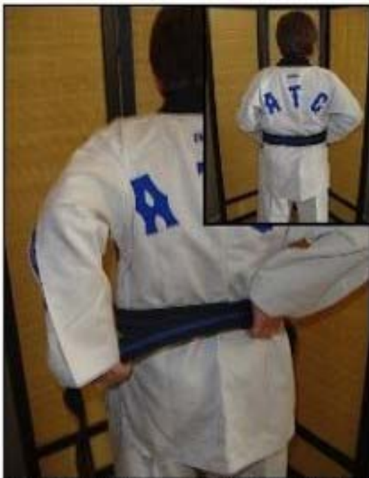
Both sides wrap around waist with one side tucking under the other side all the way around.

(If you do not tuck one side under, the belt will be incorrectly crossed behind the back.)