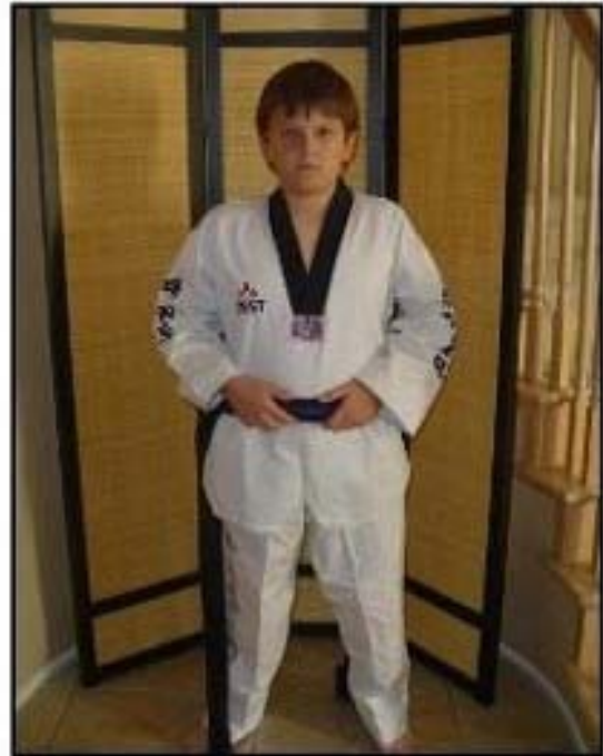
Place it on your belly button.