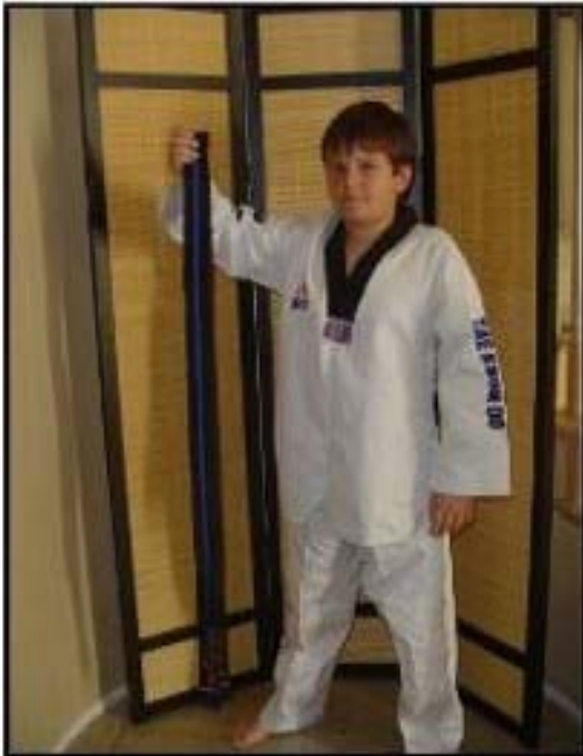
Find the center of your belt.